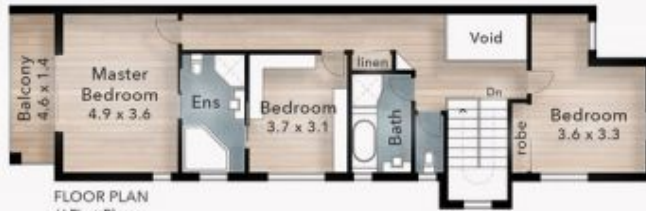
FLOOR PLAN // First Floor