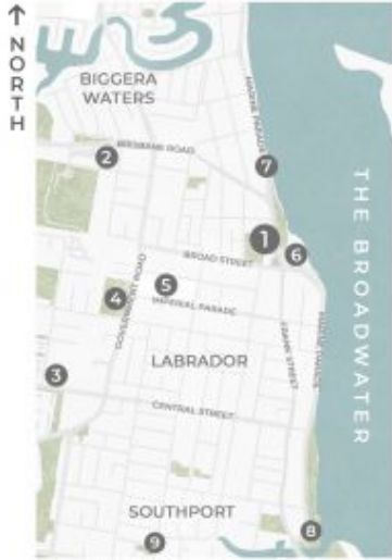
:: LOCATION MAP