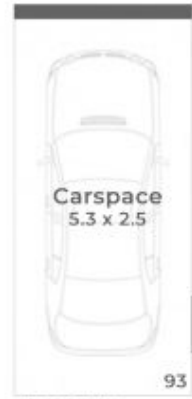
:: FLOOR PLAN Basement 1

THREE 72 1407/372 Marine Parade LABRADOR