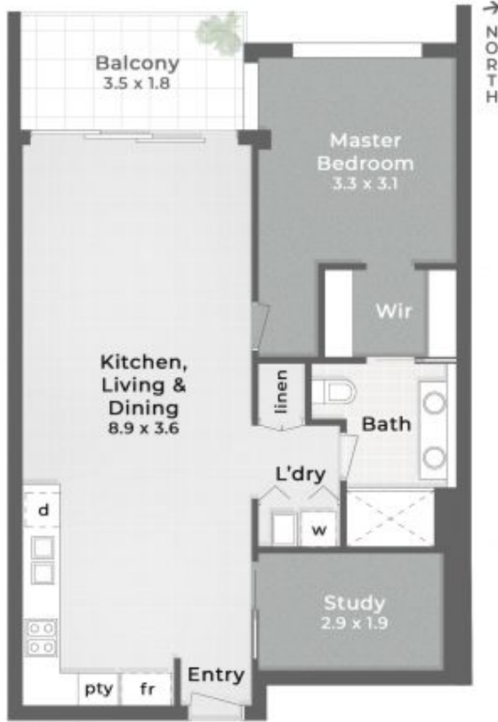
:: FLOOR PLAN Level 14 - 2.7m Ceiling