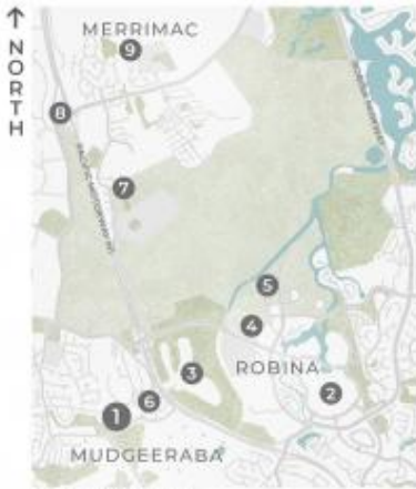
:: LOCATION MAP