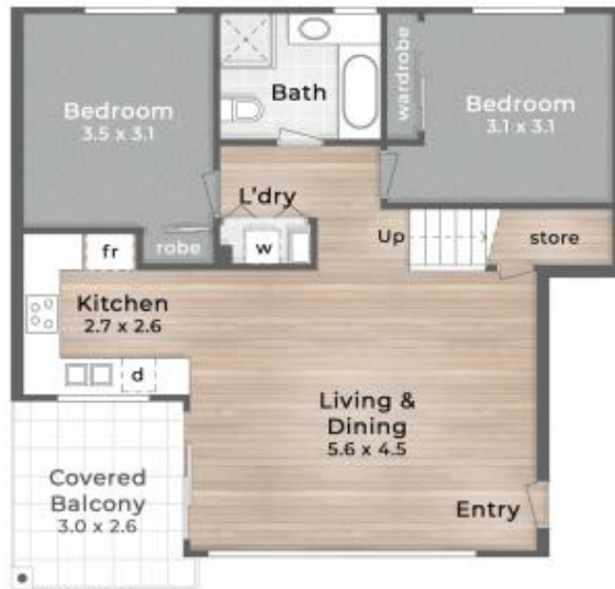
:: FLOOR PLAN Level 2