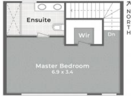
:: FLOOR PLAN Level 3