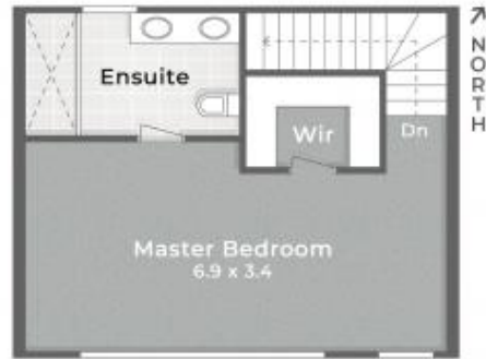
:: FLOOR PLAN Level 3