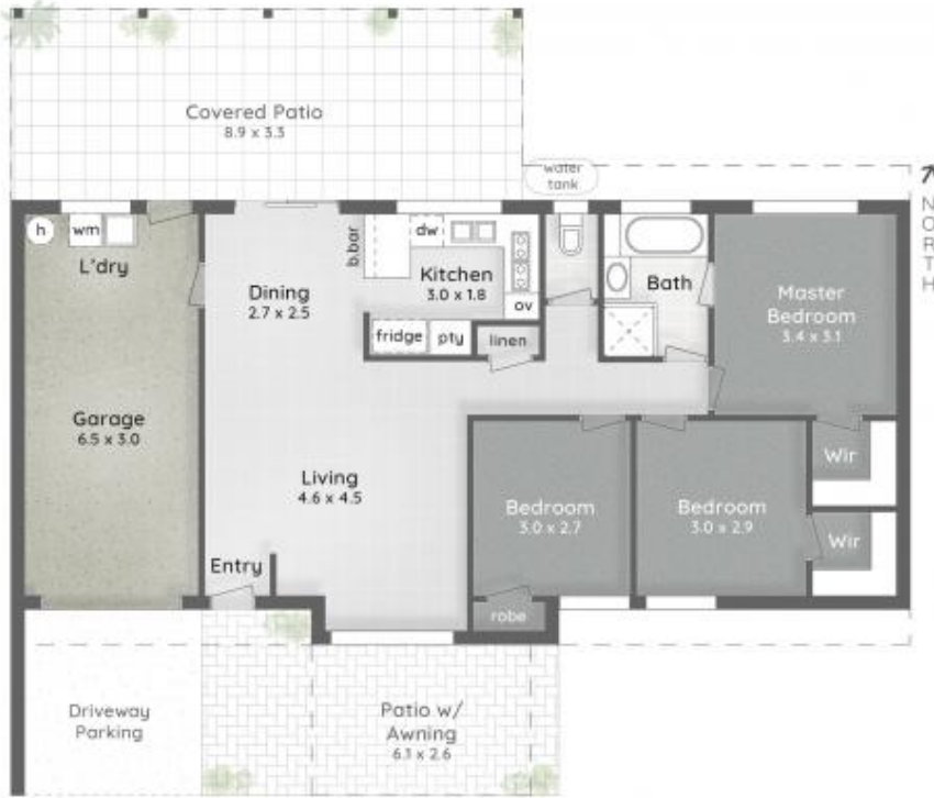
:: FLOOR PLAN