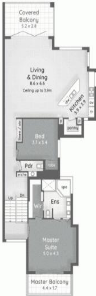
↑ FLOOR PLAN Upper Levels - 2.7m Ceiling