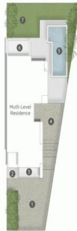
↑ SITE PLAN