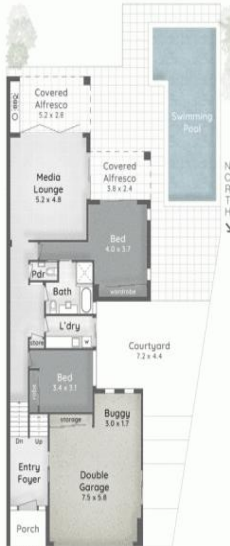
↑ FLOOR PLAN Lower Levels - 2.7m Ceiling