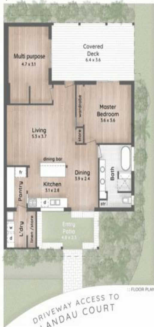
:: FLOOR PLAN