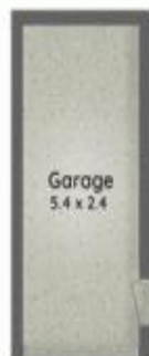
:: FLOOR PLAN Garage