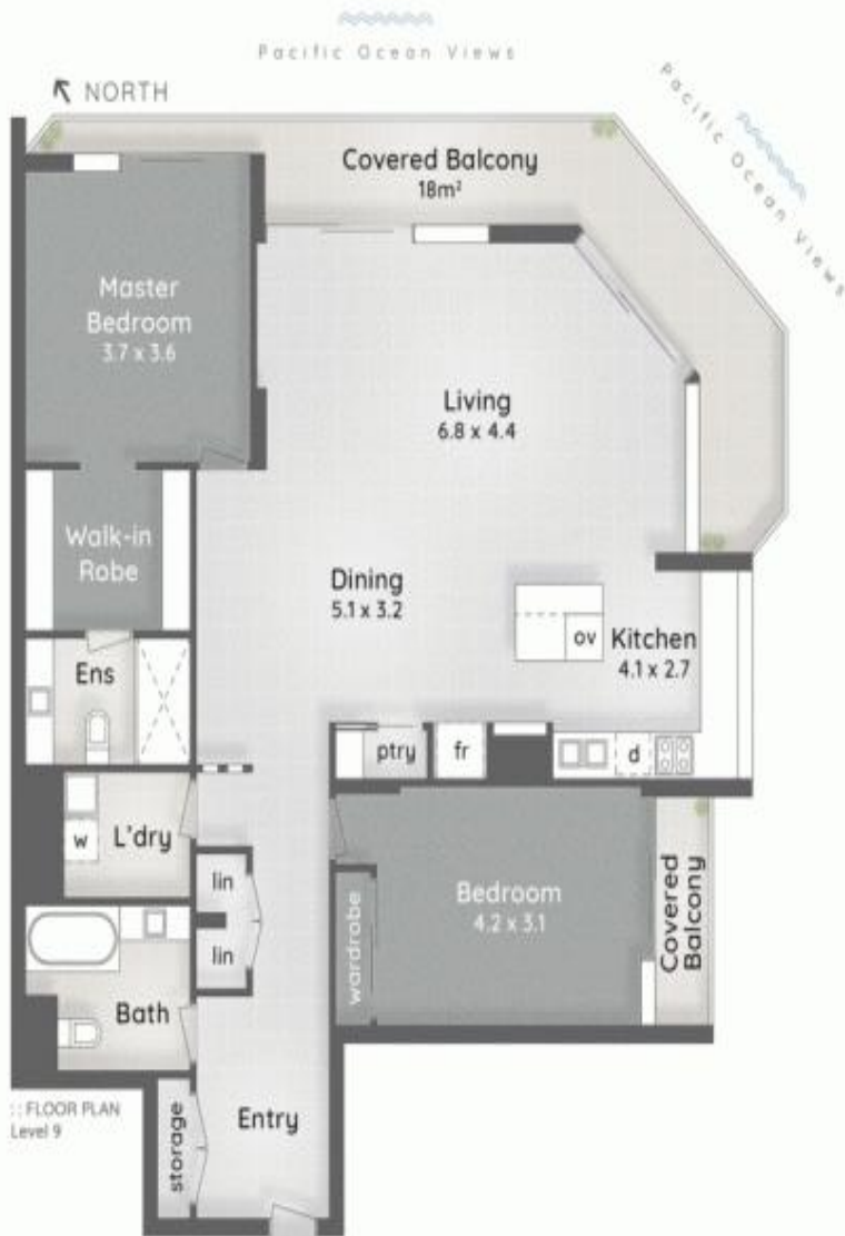
;; FLOOR PLAN Level 9