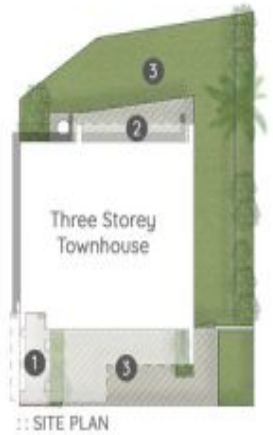
DRIVEWAY ACCESS TO TAYLOR STREET