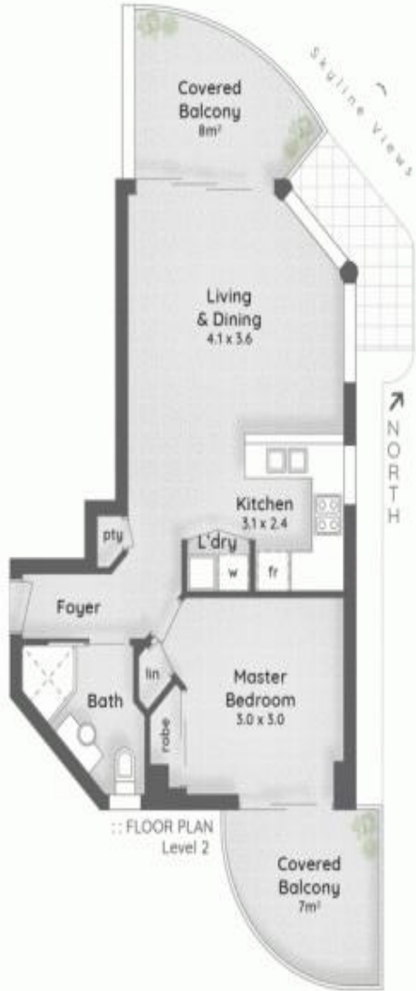
:: FLOOR PLAN Basement